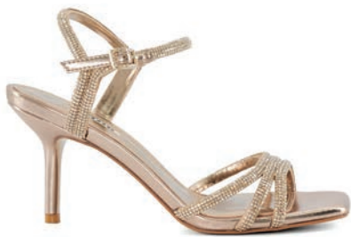
MALIAH - 649 AED