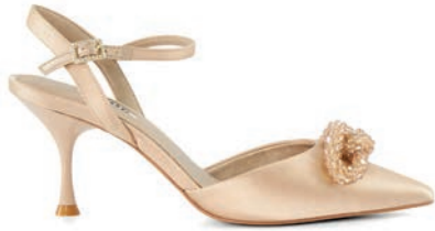
CASSILA - 649 AED