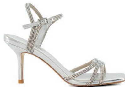
MALIAH - 649 AED