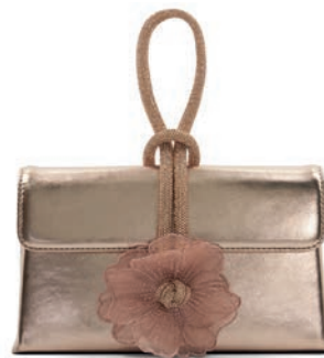
BRYNIES - 549 AED