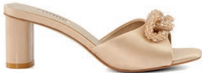
MAELANI - 599 AED