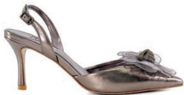
CLEMATIS - 649 AED