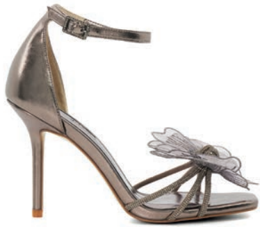
MEADOW - 649 AED