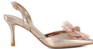
CLEMATIS - 79 QAR