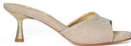
MEGS - 549 QAR