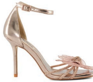
MEADOW - 799 QAR