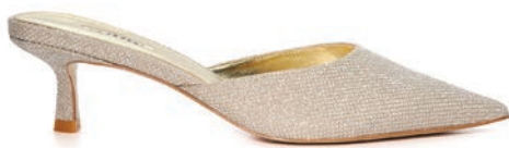
CALIOPE - 549 QAR