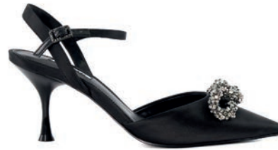
CASSILA - 799 QAR