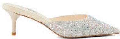
CALISE - 699 QAR