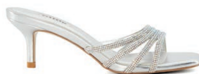
MARLOWE - 699 QAR