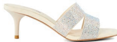
MADELIN - 799 QAR