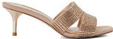
MADELIN - 799 QAR