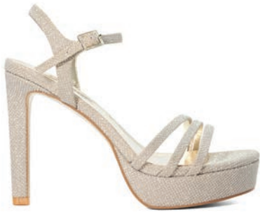
MULBERRIE - 649 QAR