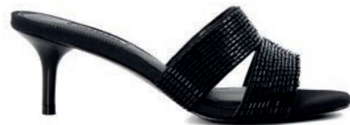
MADELIN - 799 QAR