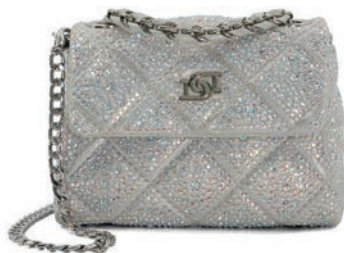
SPARKLIE - 32 OMR