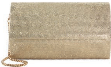
ESMES - 52 OMR