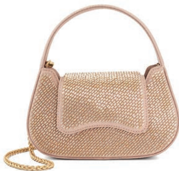
BRYSTOL - 59 OMR