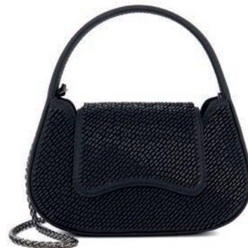
BRYSTOL - 59 OMR