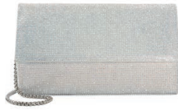
EMSES - 45 KD