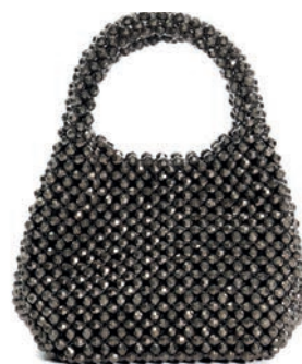
BREILLA - 45 KD