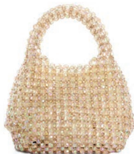
BREILLA - 45 KD