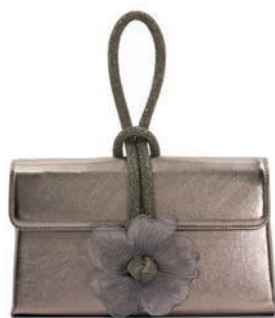
BRYNIES - 39 KD