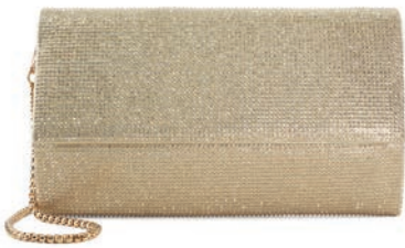
ESMES - 45 KD