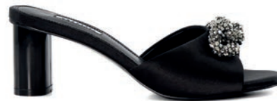
MAELANI - 59 KD