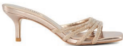
MARLOWE - 59 KD