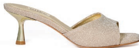
MEGS - 549 SAR