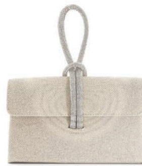
BRYNIE - 59 BD