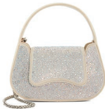
BRYSTOL - 59 BD